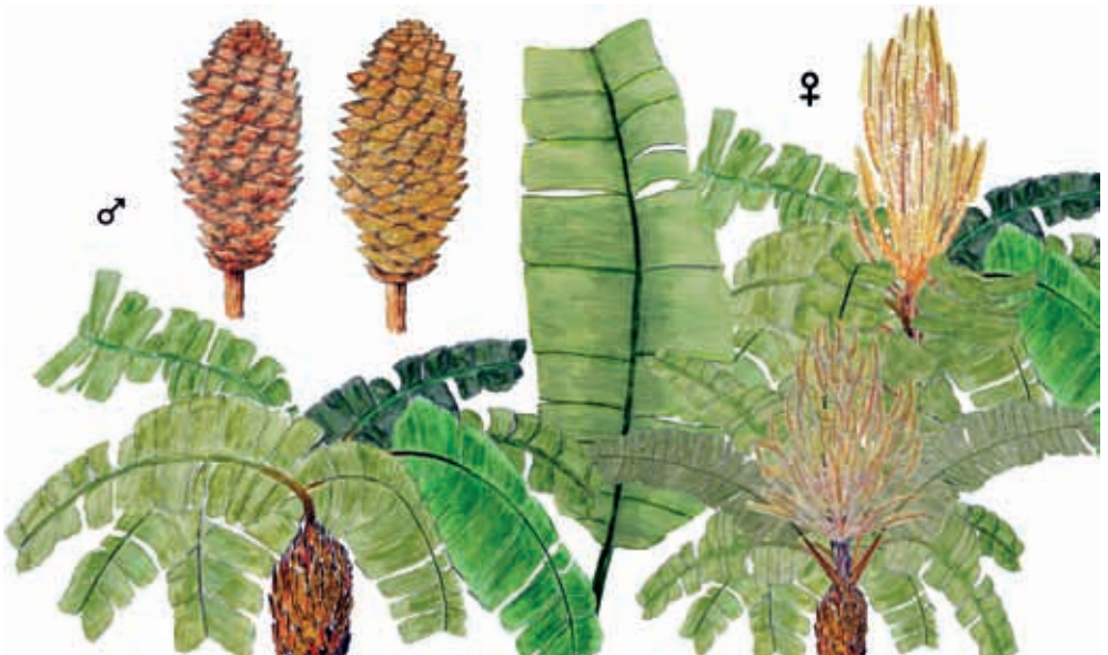
Male cone Theydostrobus marebbeii